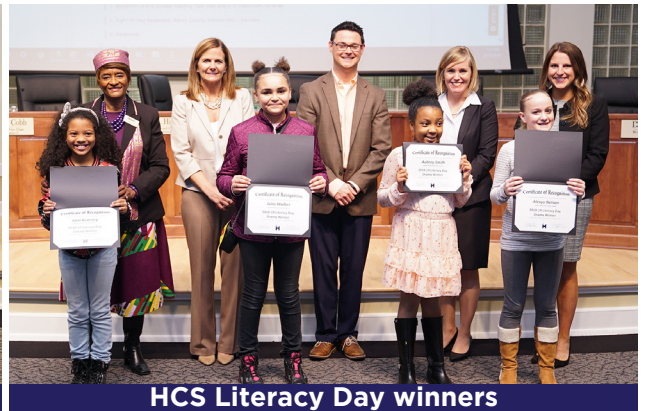
HCS Literacy Day winners