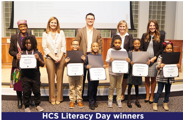
HCS Literacy Day winners