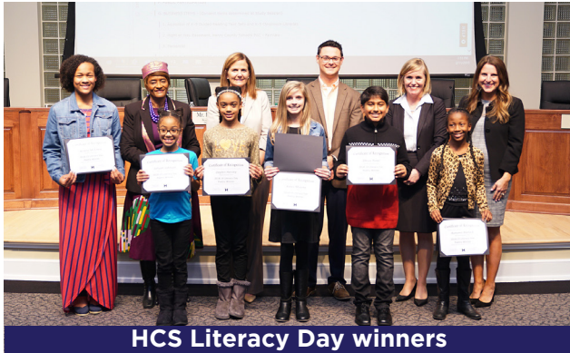
HCS Literacy Day winners