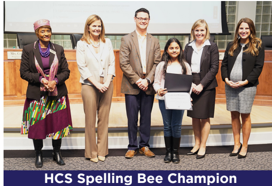
HCS Spelling Bee Champion