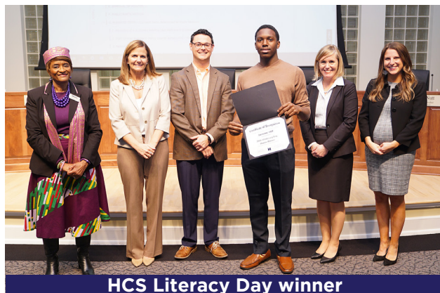
HCS Literacy Day winner