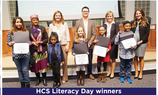
HCS Literacy Day winners